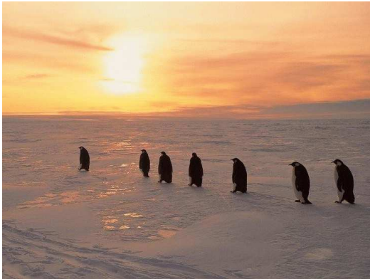
Penguins Stranded? See report below.

Tags: Kyoto liabilities, Antarctic ice, penguins, environmental hypocrites, climate summits, false consensus, species extinction, kill climate sceptics, climate summit, natural gas car.