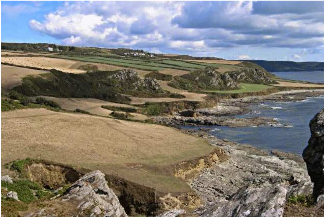
A Stranded Beach - Coastline east of Prawle Point, South Devon England – shows an old beach now well above current sea levels

Earth's natural thermometers are now flashing an amber warning. The long-term trends point to growing glaciers and falling sea level. These warn us that the warm moist bountiful Holocene Era is past its peak. The next chapter in Earth's History will be a long, hungry, ice-bound era. Only humans who are good at hunting and gathering or have easy access to nuclear or carbon energy will survive.